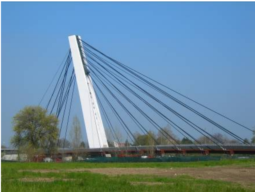
Figure 5: antenna “De Gasperi”.