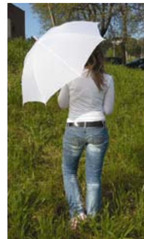
Figure 8: example of an everyday usage of the white color.