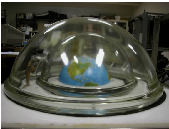
Figure 3 shows the prototype: two concentric domes lay on an insulating Teflon plate. Inside the inner dome a spherical cap represents the Earth surface. An array of temperature sensors are installed on the Earth surface. Vacuum is made inside inner dome to allow only radiative heat exchanges. Vacuum inside inner dome is made by a vacuum pump. CO 2 fills the space between the two domes to avoid frost formation.

Mathematical models have been experimentally proved (CIRIAF Congress proceedings march 2007) by means of a lab prototype. It reproduces heat exchange among Sun, Universe and Earth.