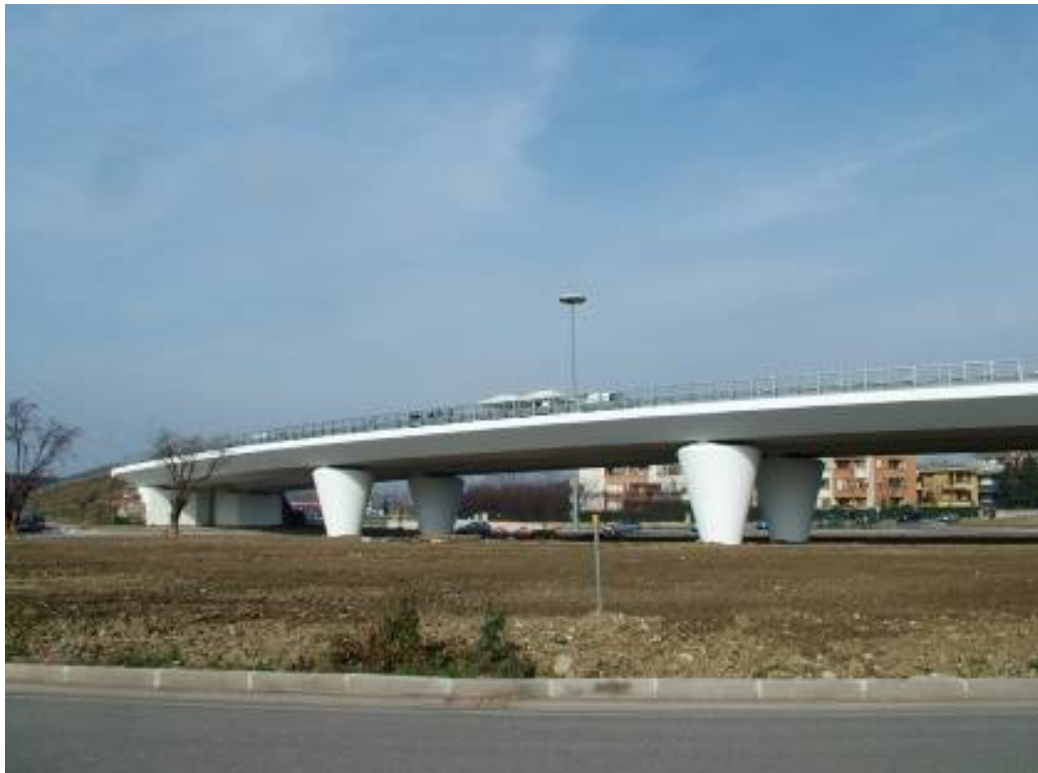
Figure 4: viaduct Langhirano Highway.