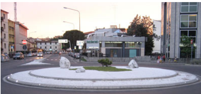
Figure 7: example of flowerbed furnish by calcium carbonate gravel.