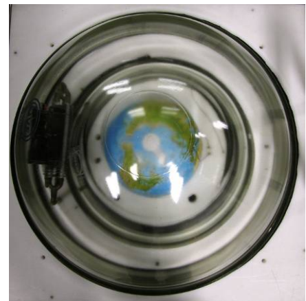
Figure 3: lab prototype.

Vacuum inside inner dome is made by a vacuum pump. CO 2 fills the space between the two domes to avoid frost formation. An heat exchanger keeps CO 2 temperature at -35°C. High pressure xenon lamp illuminates the Earth-like surface passing through the two domes.