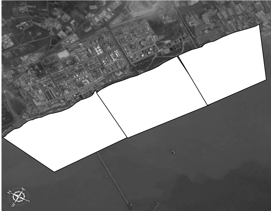
Figure 6: salt-working sites.